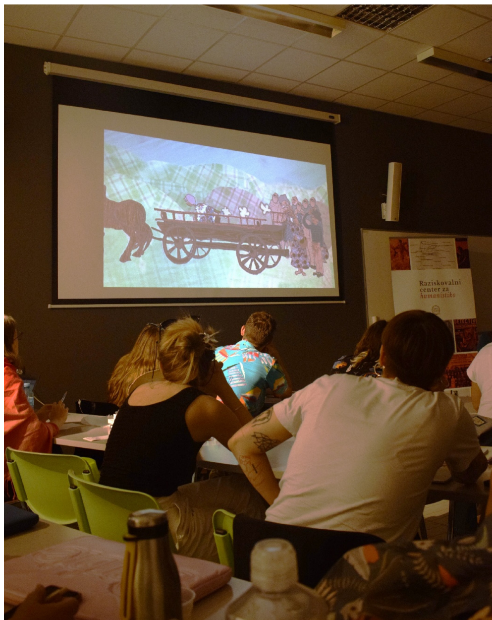
A moment from the short film Francka (2015) by Ana Čigon