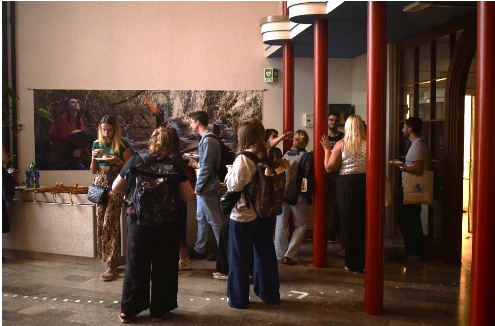
A get-together in the faculty hall